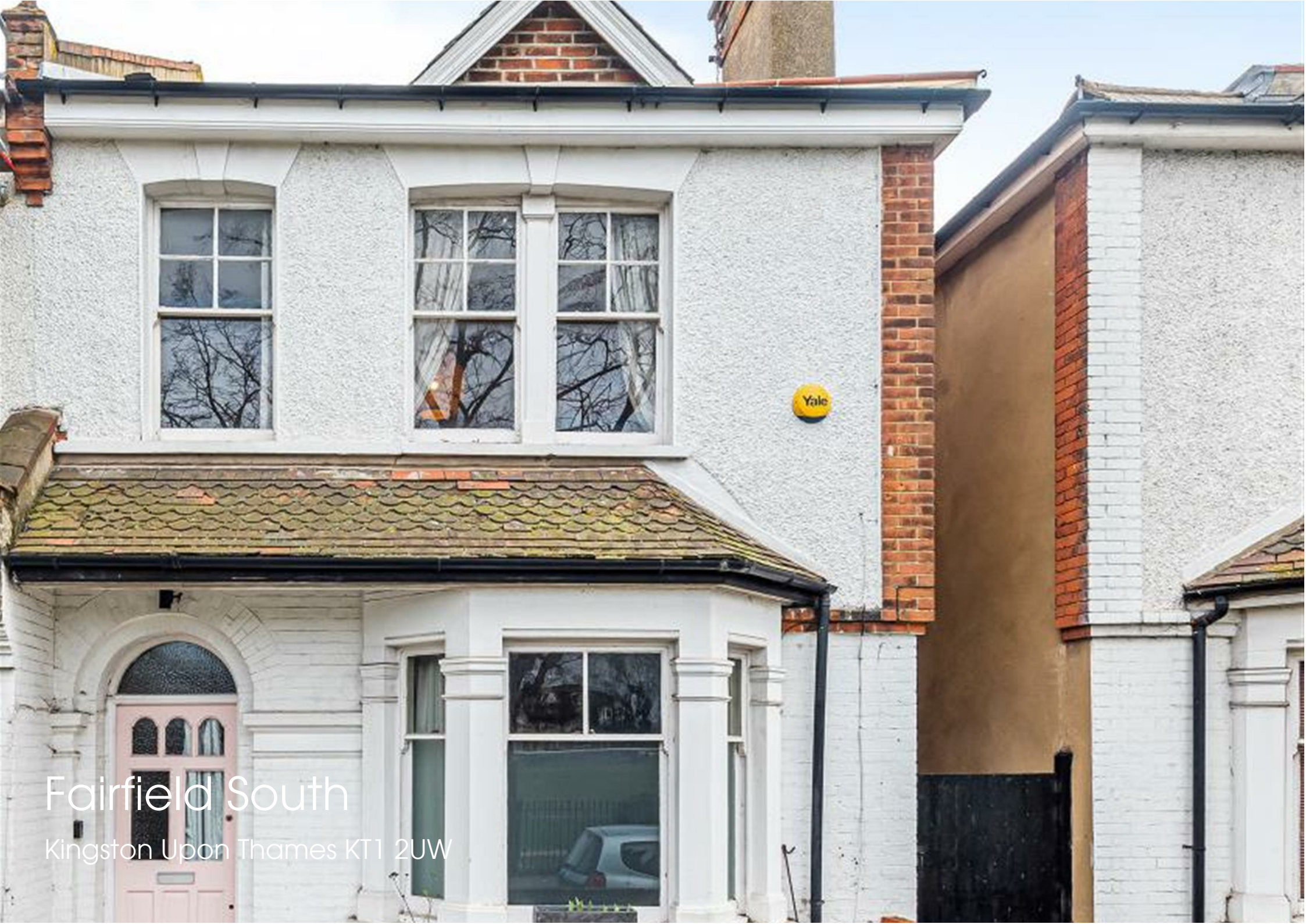
Fairfield South Kingston Upon Thames KT1 2UW